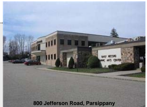
800 Jefferson Road, Parsippany